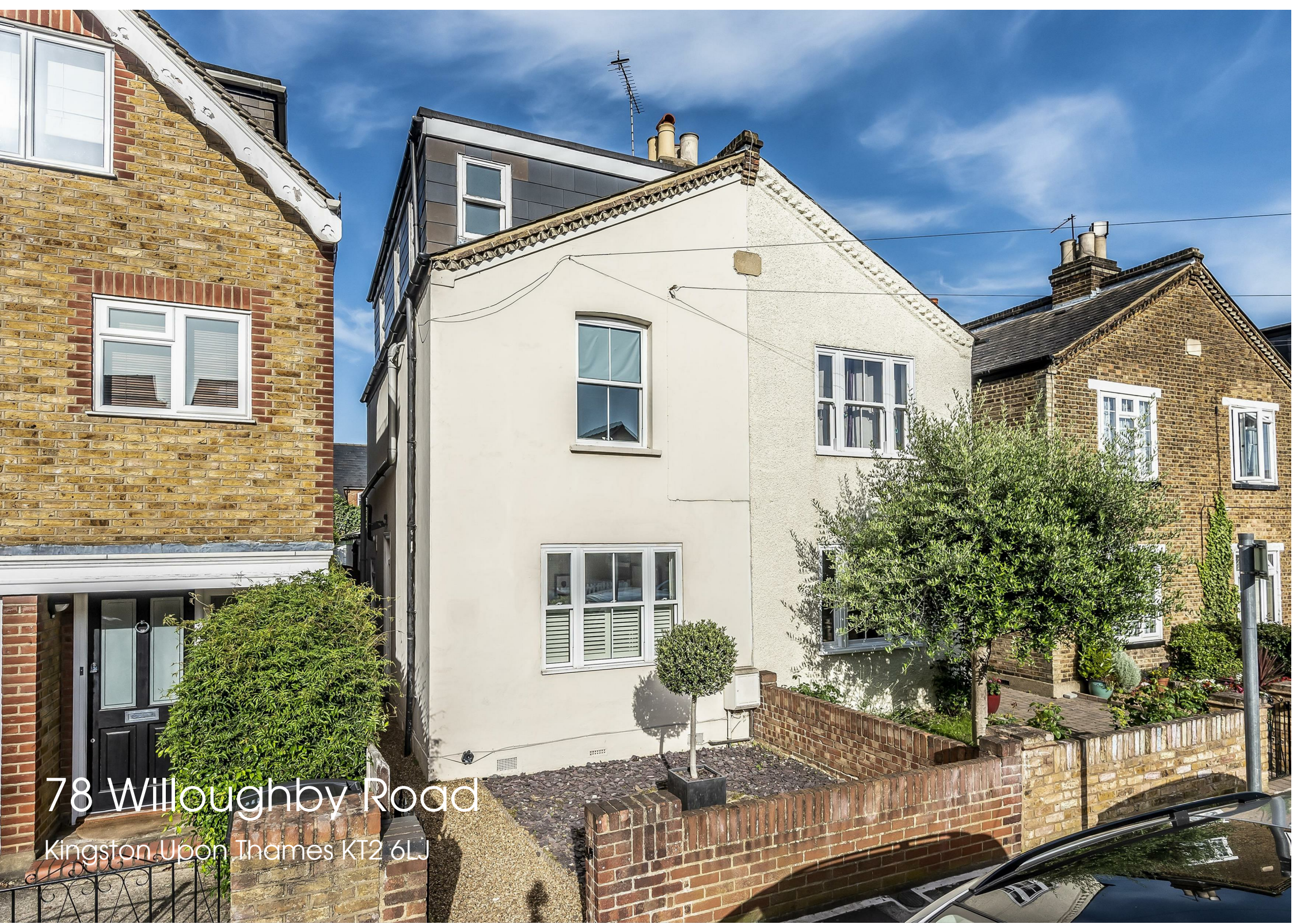
78 Willoughby Road Kingston Upon Thames KT2 6LJ